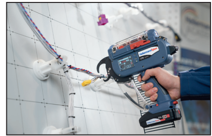
Operated by battery with cable tie bandolier