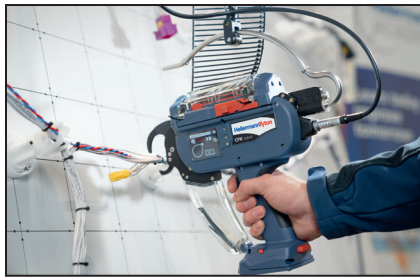
Operated by power supply

You have the choice: cordless operation with rechargeable battery pack, corded with AC power, or a combination of both.