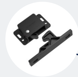
Concealed push-to-close latch keeps panels closed