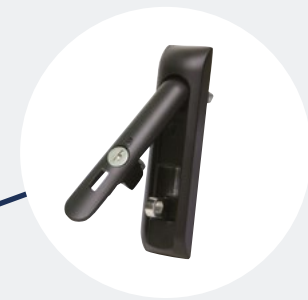
Multipoint Swing Handle option with electronic upgrade capability