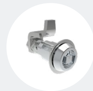
Mechanical outdoor compression latches for panel compression and security