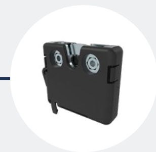
Concealed Electronic rotary latches for added security in small spaces